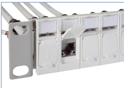
Shutter and label field