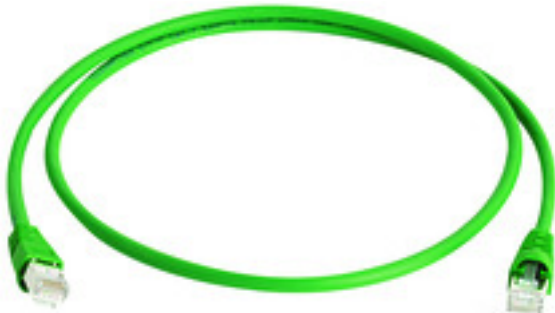
Fig. may differ

Patch Cord Cat.6 A MP8 FS 500 LSZH-0,5 m, green