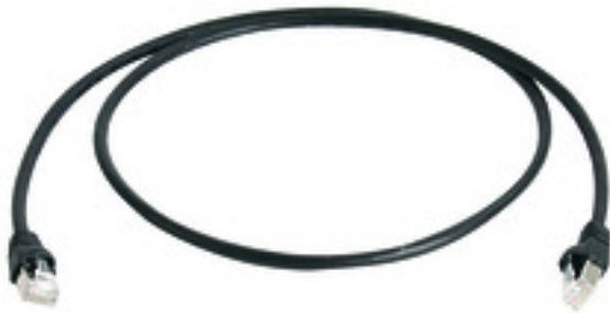
Fig. may differ

Patch Cord Cat.6 A MP8 FS 500 LSZH-1,0 m, black